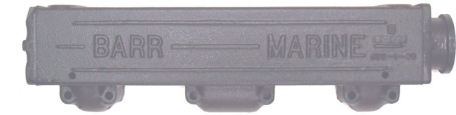
OF 1 60L