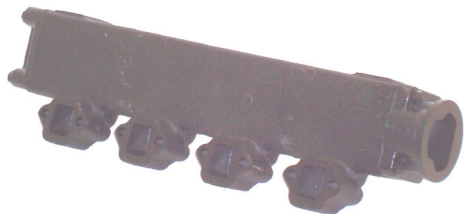
INT 1 6268R