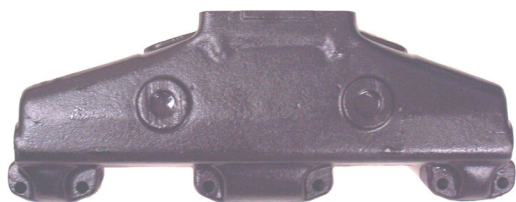
CHV 1 83