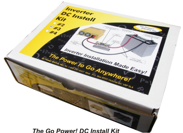
The Go Power! DC Install Kit