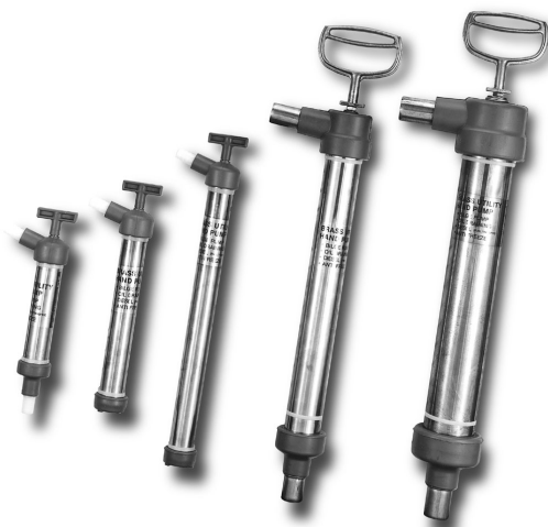
Utility Hand Pumps

To disassemble pump for cleaning and repair, pull handle out approximately 4" and place screwdriver carefully under bottom of spout cap and over outside of cylinder roll. Lift up on screwdriver and pry off spout cap. Pull out plunger shaft assembly. Lift full floating plunger off seat and clean between cup and seat. Remove intake cap in same way as spout cap. Take disc valve from cylinder and clean under neoprene flapper. Run rag through