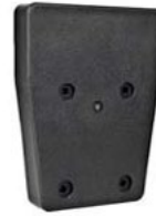
Poly board measures approx. 8" wide x 10" long Part number 99-55650

Always remove your motor from bracket when trailering. Failure to do so may result in damage to Boat, Motor or Bracket.