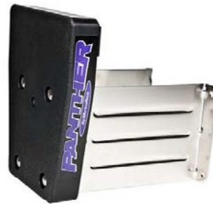
Bracket setback length including Poly board is 10.125"