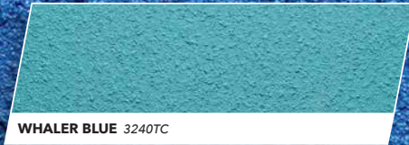
WHALER BLUE 3240TC