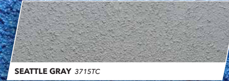
SEATTLE GRAY 3715TC