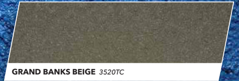
GRAND BANKS BEIGE 3520TC