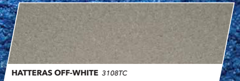
HATTERAS OFF-WHITE 3108TC