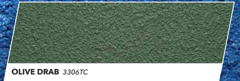
OLIVE DRAB 3306TC