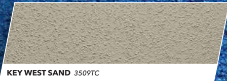
KEY WEST SAND 3509TC