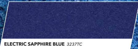
ELECTRIC SAPPHIRE BLUE 3237TC