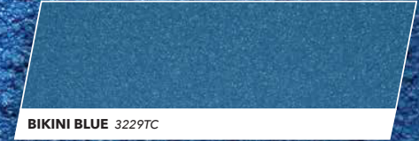
BIKINI BLUE 3229TC